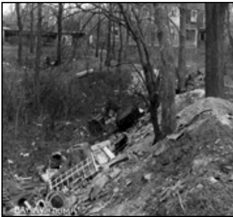
Garbage dump on Bay Avenue.

This program will feature a digitally enhanced presentation of original hand-colored magic lantern slides of TIA sites in Bloomfield. Original sites will be shown, along with what the site looks like in 2015.