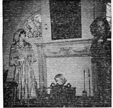
A corner of the Historical Society of Bloomfield Museum