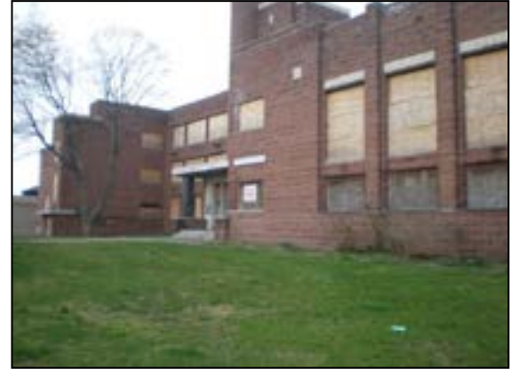
The front of South Junior High School, as it appears today.