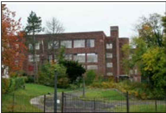
The rear entrance of the school, as seen from Walnut Street.