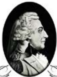
General Joseph Bloomfield